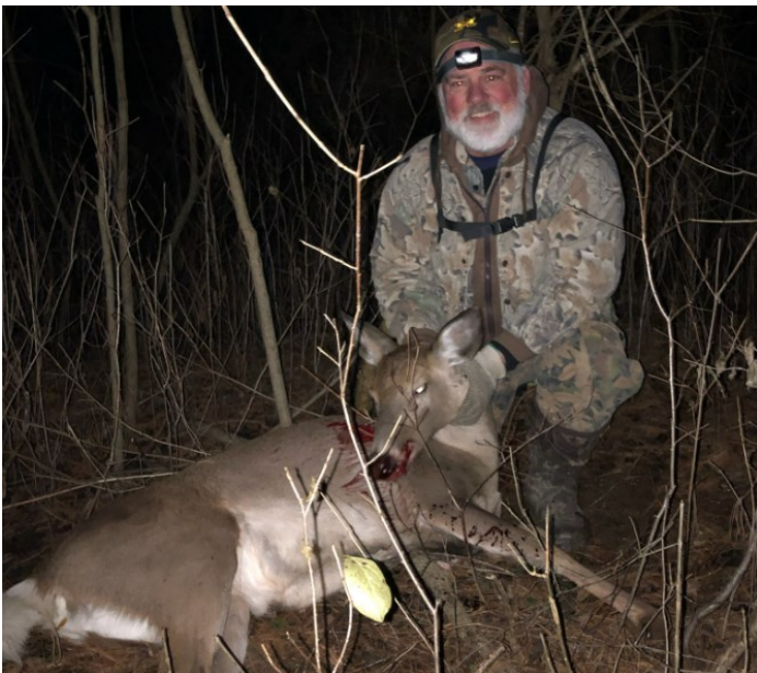
The Editor got his second doe of the season with his bow in December.